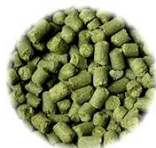
Type T90 Hop Pellets

Note: whole hops degrade faster because of the larger surface area exposed to air. Pellets are highly compressed, and therefore age more slowly than whole hops. They also take less space and are easier to vacuum pack, which is why they are often used in home brewing and micro brewing.