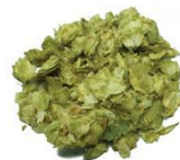
Type Leaf Hops